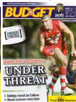
Rd 18, 2007