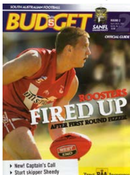
Rd 2, 2007