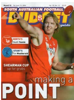
Rd 12, 2004