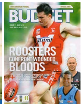
Rd 11, 2008